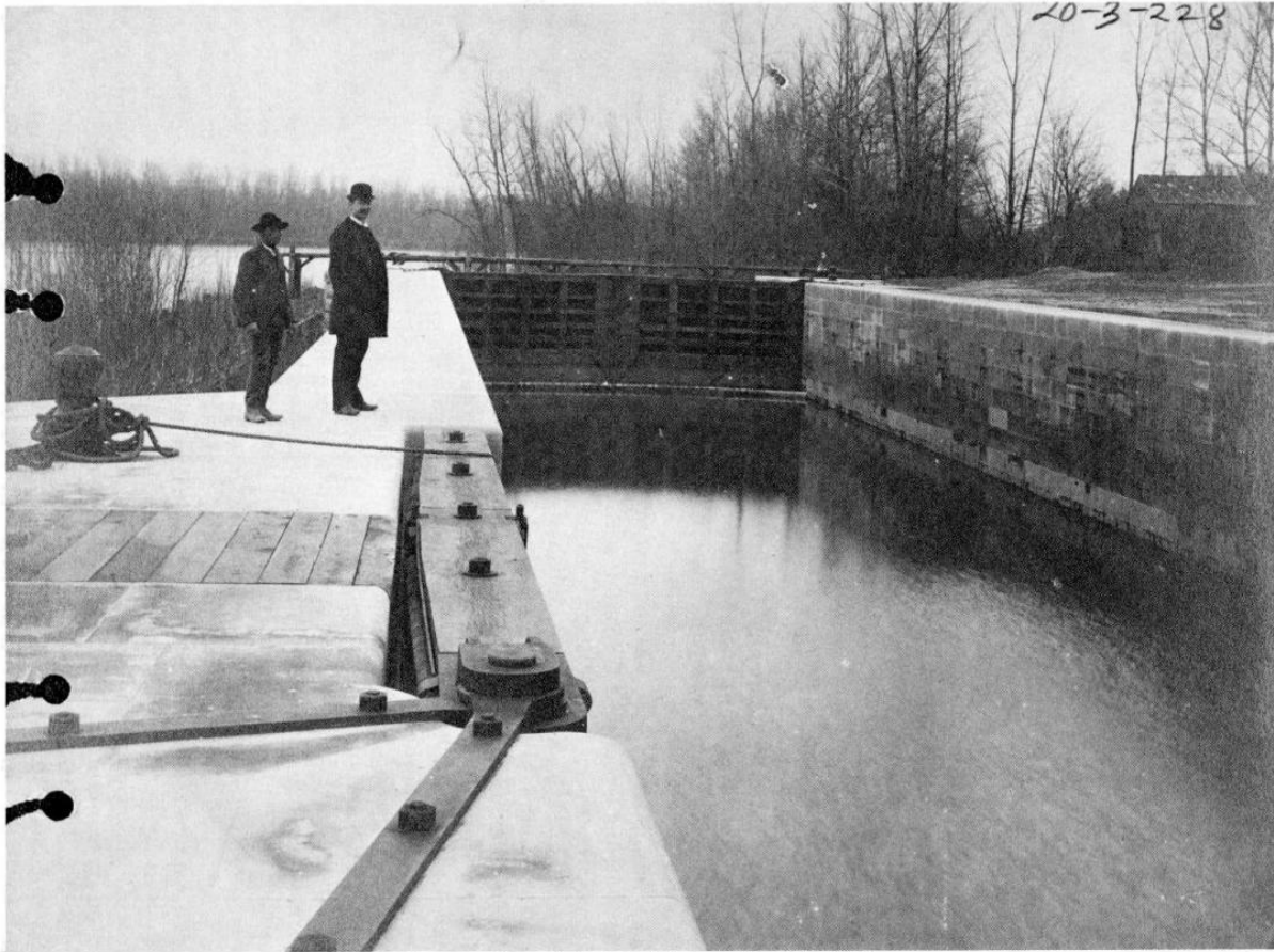
The Grand Rapids locks and dam on the Wabash River